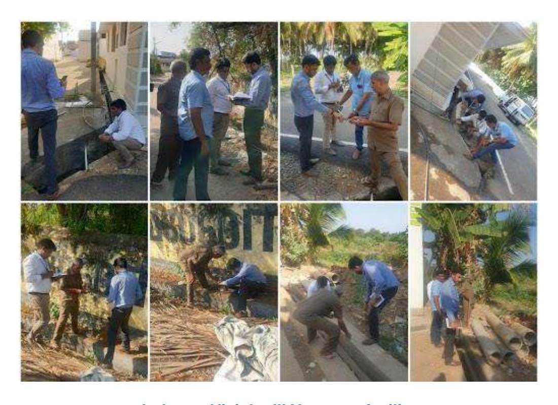
Industry Visit by III Year to e-facility