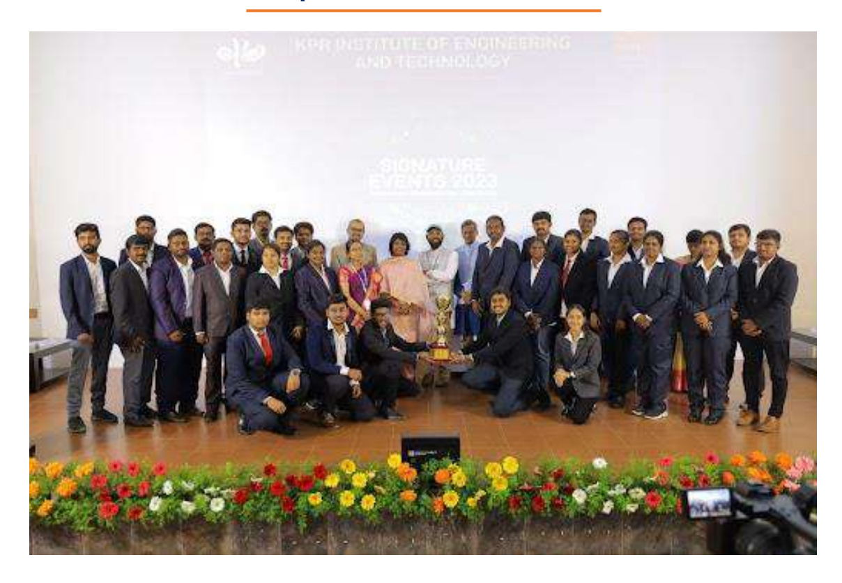
Received Best Department Award for the academic year 2022 – 2023 in Signature Events 2023