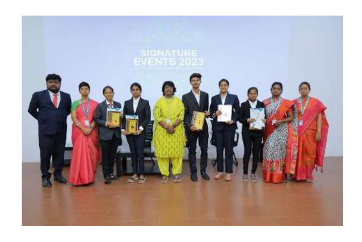
Academic Toppers of Civil Department